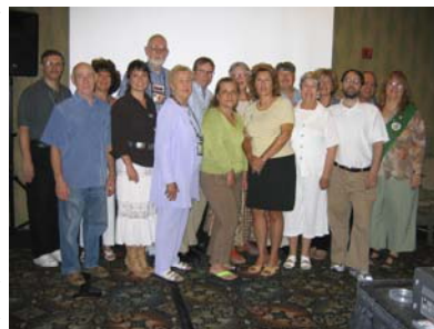
The Order Of The Sphinx—June 2007

This year's annual business meeting coincides with the annual meeting of the Hermetician's group known as The Order Of The Sphinx. The annual meeting of The Order will take place on Saturday November 20, 2010 at 9 a.m. MST. The afternoon program will either include a workshop, social event or field trip. All Hermeticians are encouraged to join The Order and participate in this weekend event.